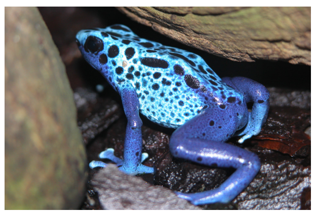
Fig. 1. Dendrobates "azureus" (= tinctorius).

1968: Hoogmoed (1969a,b) discovered populations of D. "azureus" in four forest islands in the middle of the Sipaliwini savanna near the Vier Gebroeders Mountain